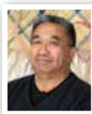
KAWITITUKURU (Te Arawa)