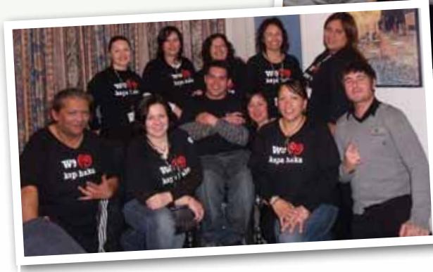
Top: The HOP earthquake response team ready to paint the town red ... zone; above: FLAVA Festival – Ngā tamariki from Ashburton Borough School; left: Kaimahi, FLAVA Festival.